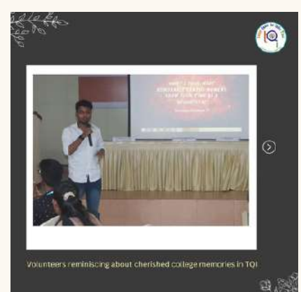
Volunteers reminiscing about cherished college memories in TQI.