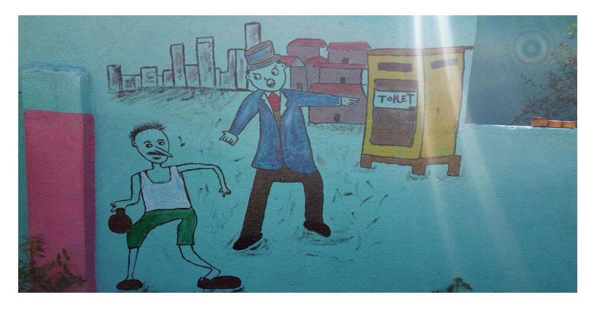
Keep the Walls Clean