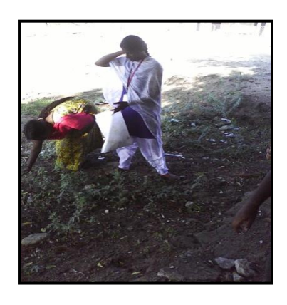
Oct 3: Games were conducted at a primary school and stationary items were given as gifts.